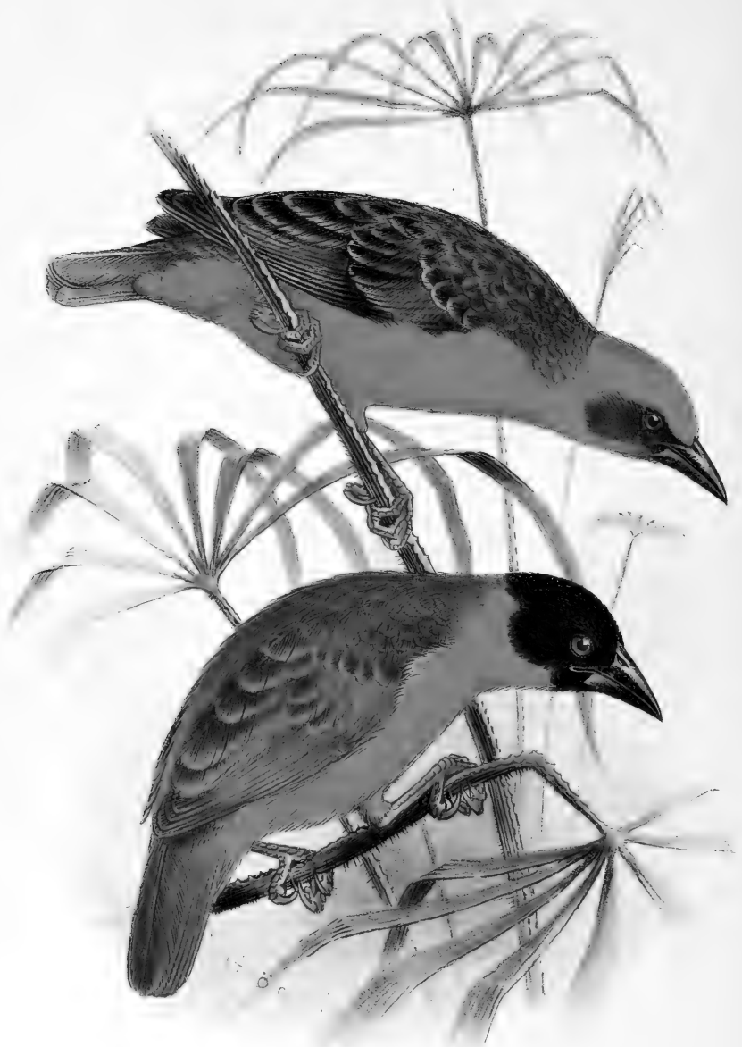
1. Karthechinus temporalis 2. Hyphantornis nyasæ